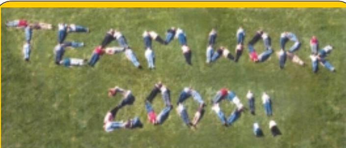
Transportation Cabinet, Dept. of Highways, District Three